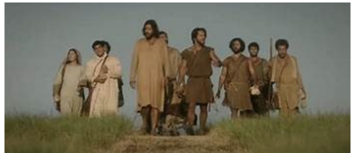
After the encounter with the Woman at the Well, they are ready to spread the Gospel!

The second resource I am very much enjoying is the new streaming series called "The Chosen." The whole production of this series is an amazing testimony by itself. But the final product of the enactments of the story of Jesus have been absolutely delightful. Just Google "The Chosen" and a number of viewing options will come up. You should be able to watch Season One for free if you don't mind some ads. We have been accessing it so far on our Roku through the YouTube Channel.